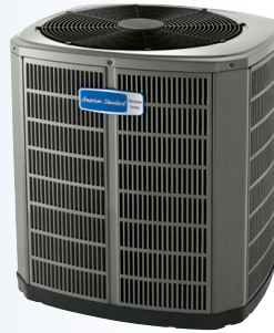
AccuComfort™ Platinum 18