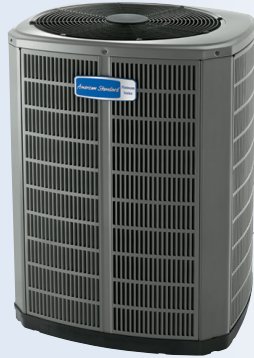
AccuComfort™ Platinum 20

American Standard Platinum air conditioners offer our highest combination of performance, efficiency, and temperature control. Built with American Standard's commitment to quality throughout, the Platinum line offers advanced energy-saving features like Duration™ variable speed compressors and Spine Fin™ coils.